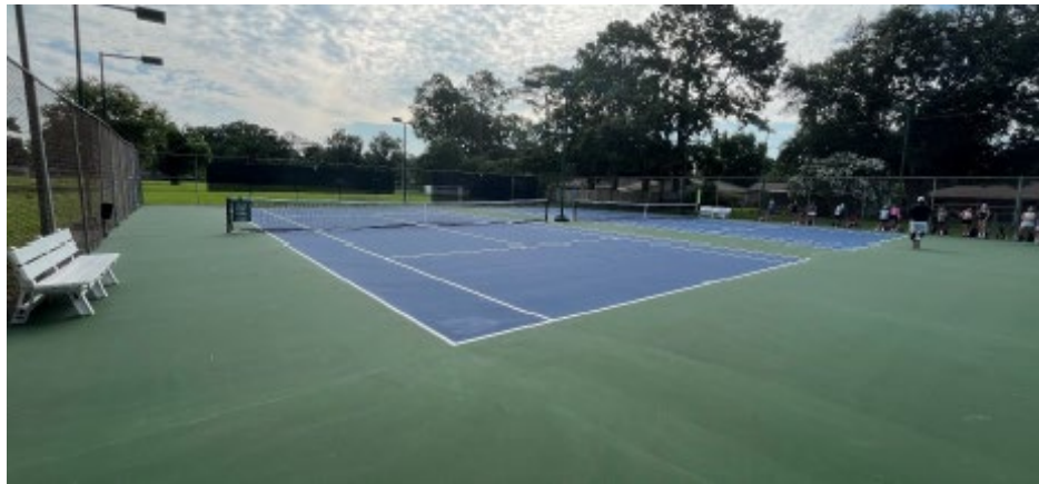
Thomas Park Tennis Courts Renovations Phase I