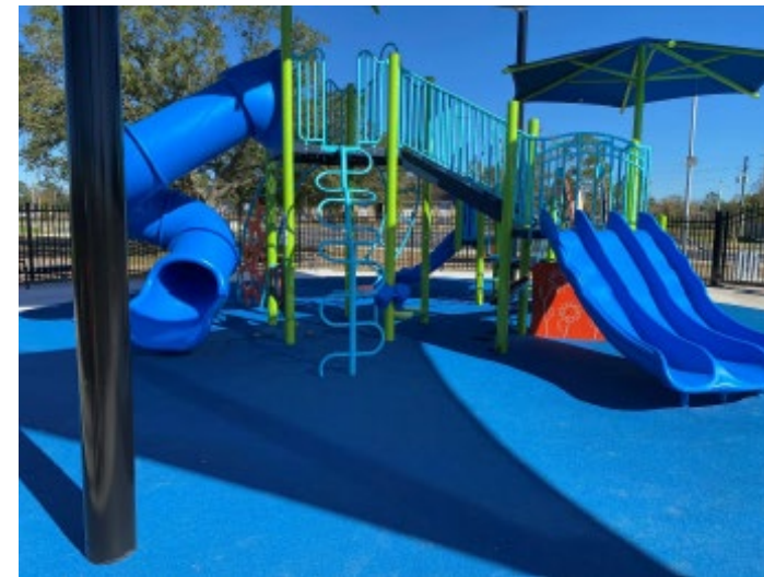
Brown Park Renovations