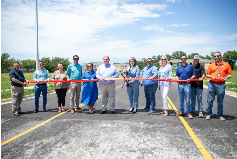
Lake Farm Road to Settlers Trace Extension