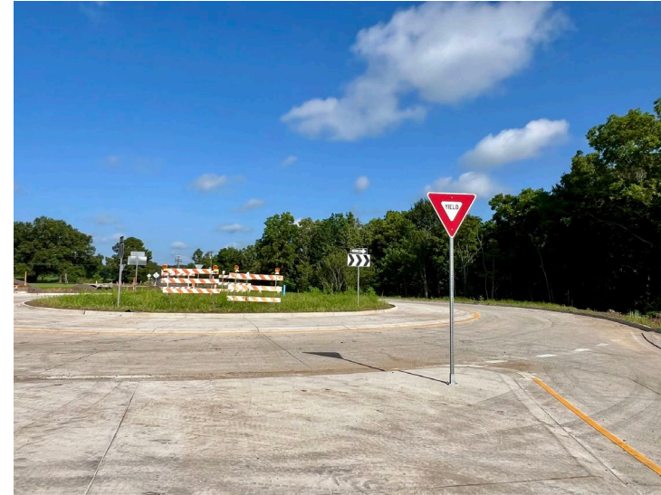
Louisiana Avenue Extension Gloria Switch Roundabout